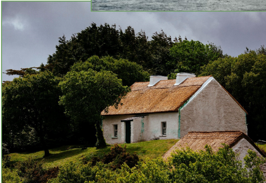
Shown here: Traditional Irish Cottage and Kylemore Abby, Connemara Ireland.